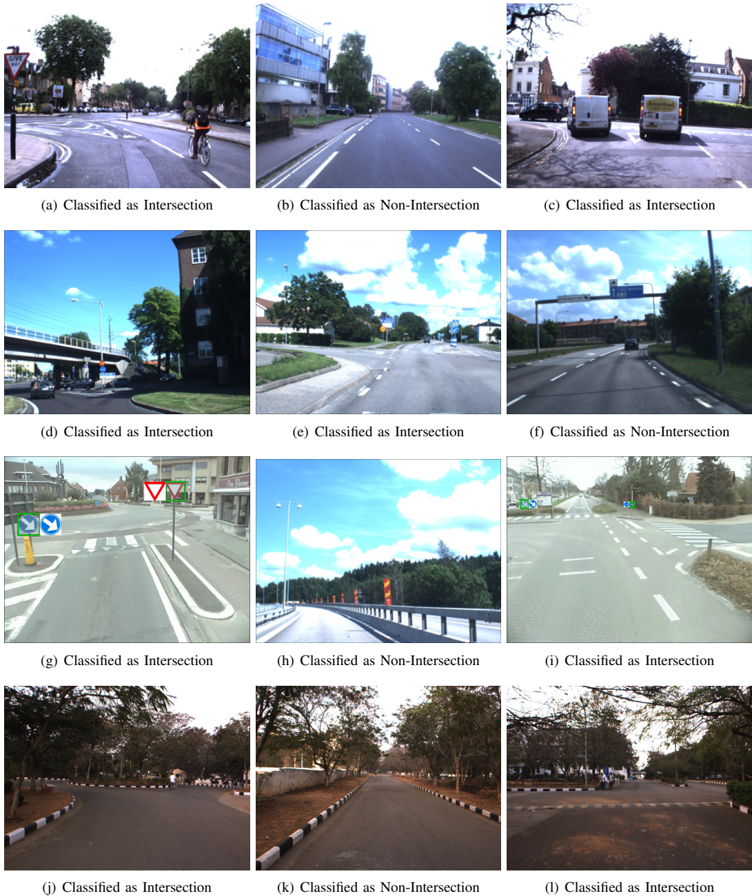
Fig. 3. Qualitative results: Our trained model was tested on various sequences from different datasets, spread over different continents.

It is essential to enable field agent to understand complexity of the surrounding environment.